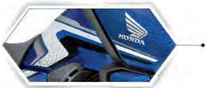
MATTE MARVEL BLUE METALLIC