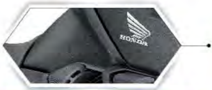
MATTE AXIS GRAY METALLIC