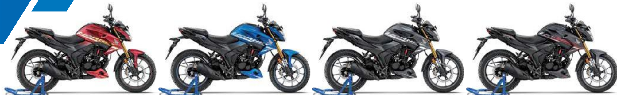
MATTE SANGRIA RED METALLIC